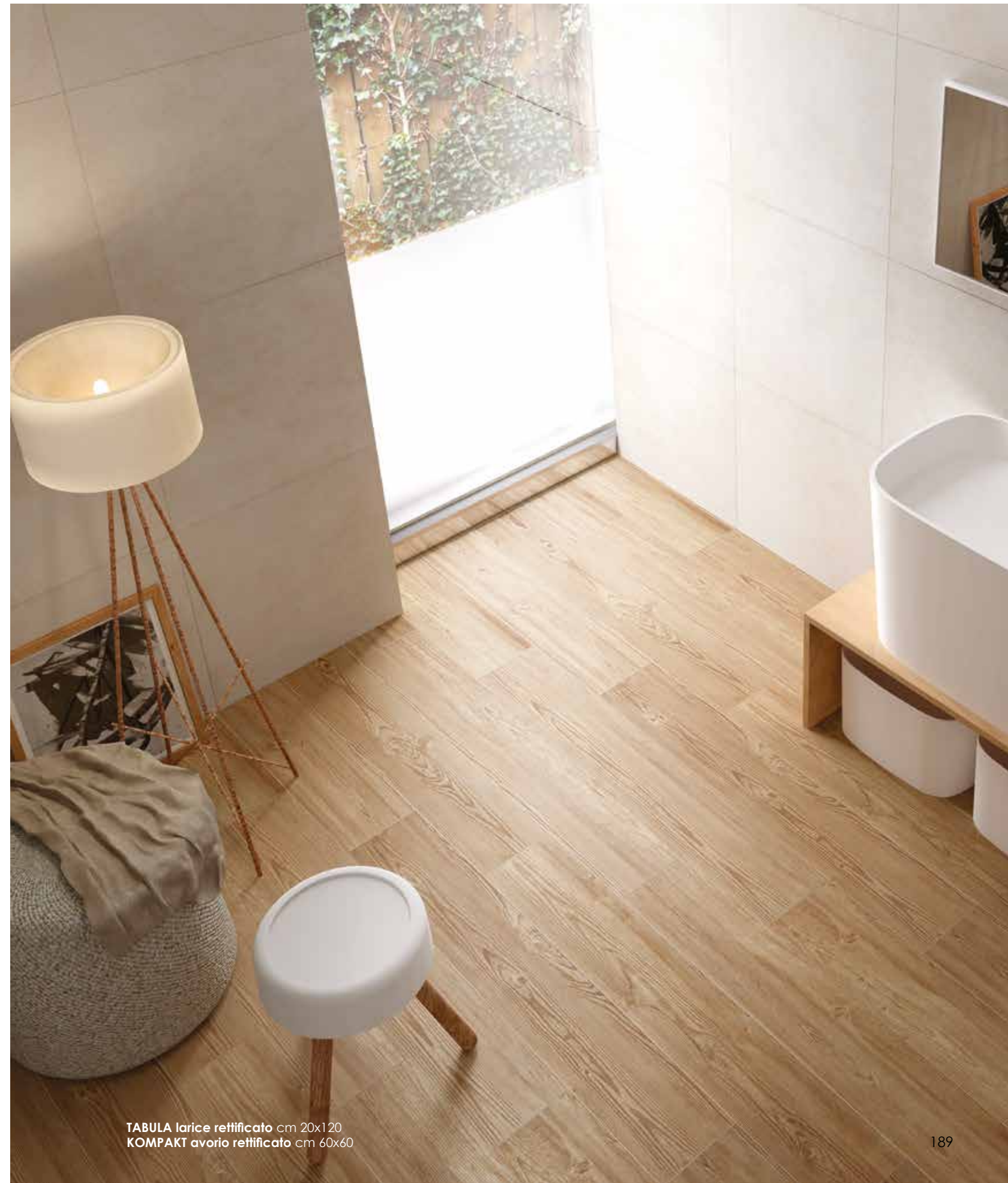
TABULA larice rettificato cm 20x120 KOMPAKT avorio rettificato cm 60x60